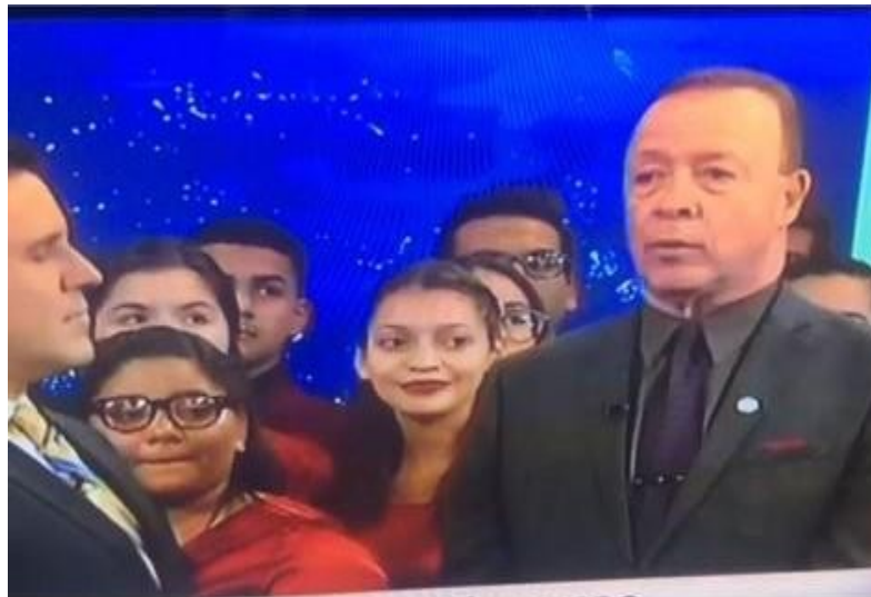
2019. With the Choir of the Enclosure of Humacao in WAPA Television.