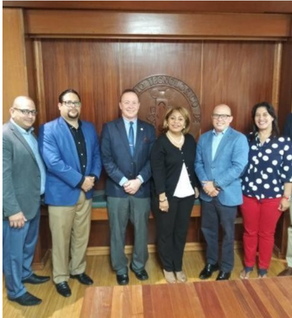
2019. In the Institute Technological of Santo Domingo (INTEC), together to their authorities. The UPRH and INTEC established a pre-agreement of collaboration.