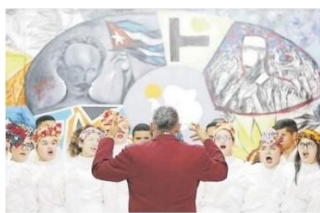
Coro UPR-Humacao resuena en Cuba Actuó en La Habana y participó en varios intercambios culturales